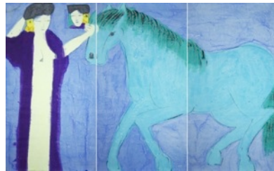
Walasse Ting - Woman in Purple Looking in the Mirror with a Blue Horse (Triptych) Early 1980s 178x96.5 cm x3 Ink and Acrylic on Chinese Paper