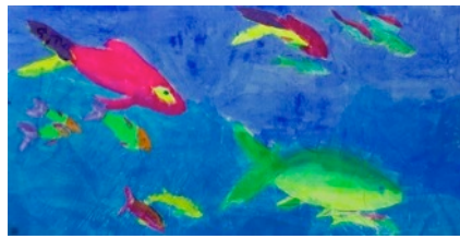
Walasse Ting - Ocean Full of Fish No. 1 121.5x244cm 1990s Chinese Ink and Acrylic on Rice Paper