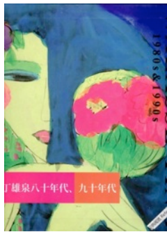
To Love To Fresh Published in 2011

Walasse Ting passed away in 2010. In the fall of the same year, Longmen Art Projects began operating in Shanghai and became the international representative of the Walasse Ting Estate Archive based in New York. Working closely with Ting's family, Longmen Art Projects dedicated much of our efforts to present and promote Walasse Ting's legacy through documents, photographs, letters, and artworks. Over the next three years, two museums and 5 galleries in Asia exhibited much of these through solo or retrospective shows. Furthermore, Longmen Art Projects has also published three albums: To Love To Fresh , Red Mouth Series: Kiss Me Kiss Me , and Red Mouth Series: Love Me Love Me , gathering many records and artworks from acrylic works on archival paper in the 1970s to Chinese ink and acrylic works on Chinese paper works in the 80s and 90s. While the Asia region saw Walasse Ting as a 20th century modernist, Western observers would categorize his artistic language as more contemporary.