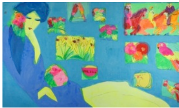
Walasse Ting - Lady in Blue 145x233cm 1992 Chinese Ink and Acrylic on Rice Paper