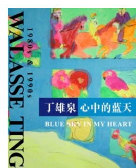
Blue Sky in My Heart Published in 2013